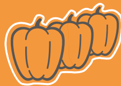
Different product geometries, e.g. flow wrapped packages

Especially with irregular products, such as whole chicken, vegetables in tubular bag packaging, skin packaging or cheese, this solution is optimally used.