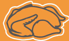
Irregular product geometries, e.g. natural products