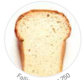
Falling Number 250