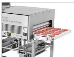
HOMESTYLE® PATTY CONVEYOR