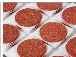
PATTIES ON PAPER